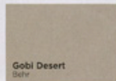
Gobi Desert Behr