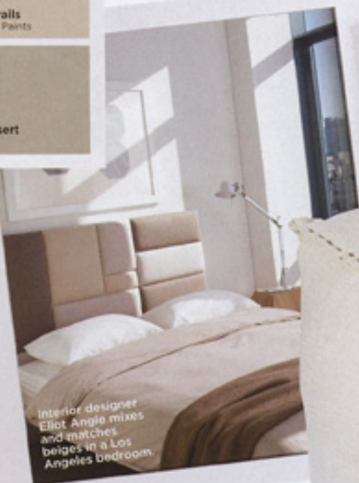
Interior designer Eliot Angle mixes and matches beiges in a Los Angeles bedroom.