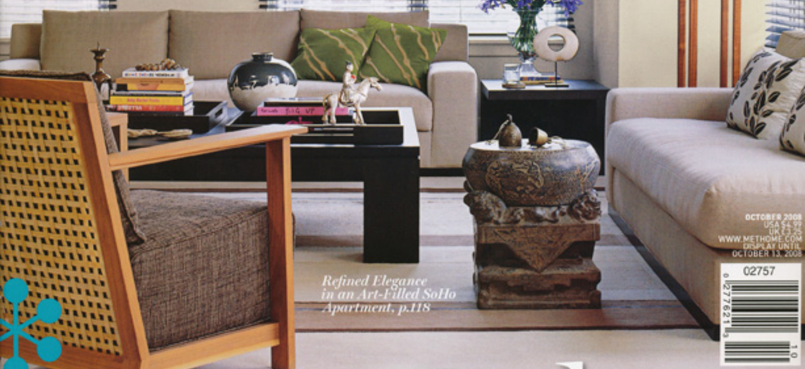
Refined Elegance in an Art-Filled SoHo Apartment, p.118

Lamps We Love Color: Fashion- Forward Neutrals