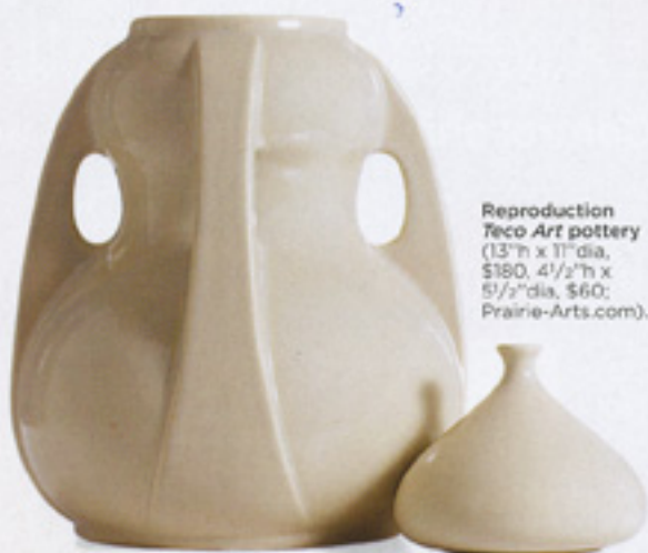
Reproduction Teco ART pottery (13" h x 11" dia, $180, 4 1/2" h x 5 1/2" dia, $60; Prairie-Arts.com).

"Even neutrals have a hue. You need to be careful when layering beiges to make sure they have the same parent color, or they'll clash."