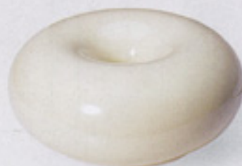
Naoto Fukasawa's Humidifier Version III resembles a water droplet (6" h x 12" dia, $260; Dynamism.com).