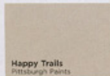
Happy Trails Pittsburgh Paints