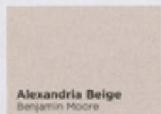
Alexandria Beige Benjamin Moore