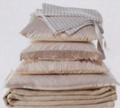
Organic Pure Comfort cotton bedding from pureDKNY (from $75/two pillowcases; @bloomingdales.com).