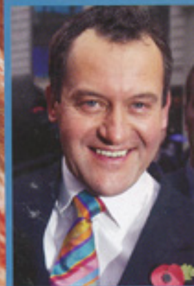
BUTLER PAUL BURRELL