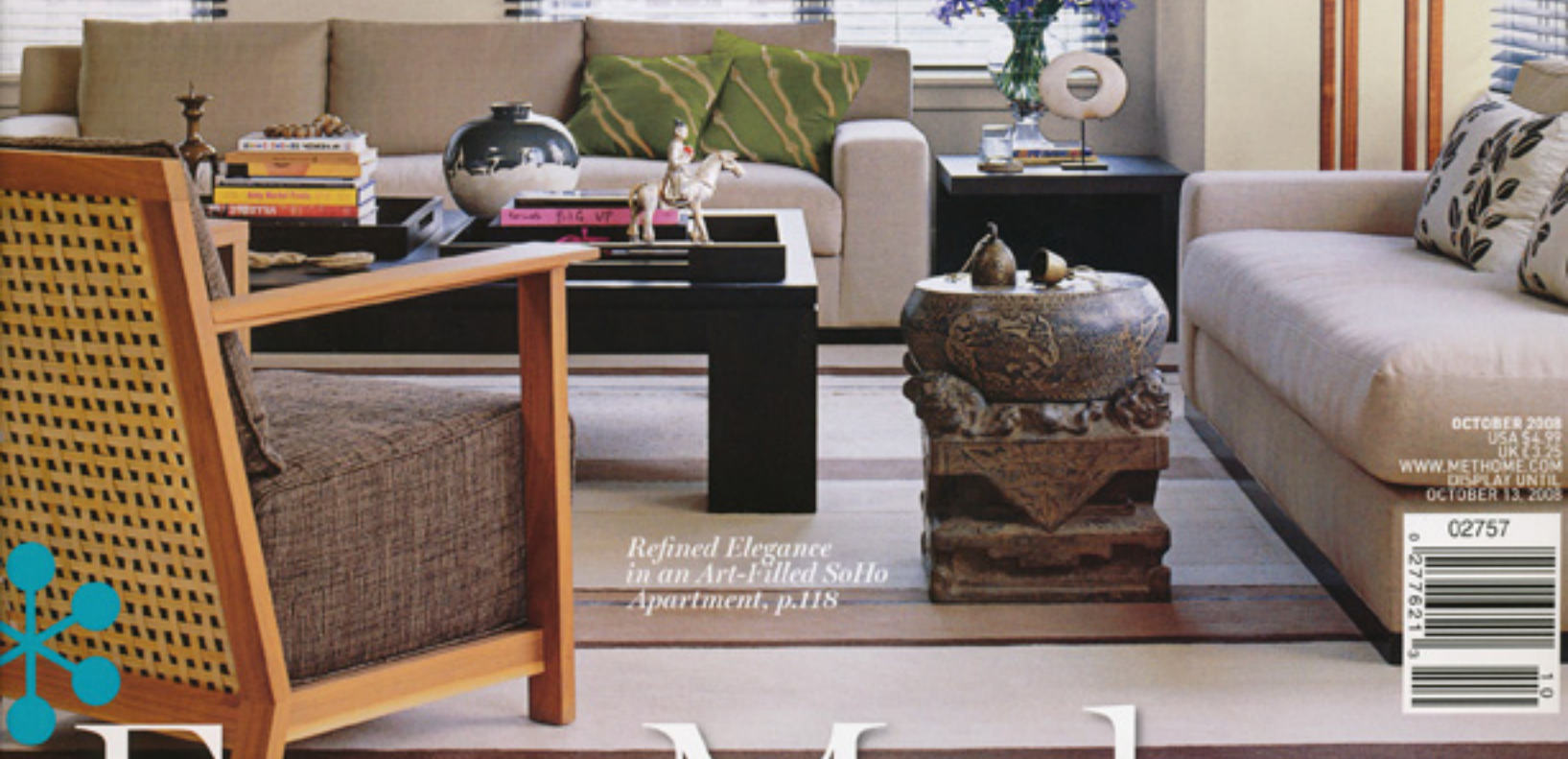
Refined Elegance in an Art-Filled SoHo Apartment, p.118

Lamps We Love Color: Fashion- Forward Neutrals