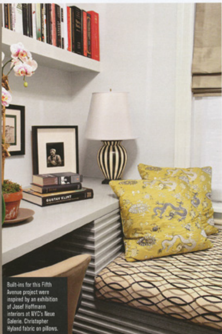
Built-ins for this Fifth Avenue project were inspired by an exhibition of Josef Hoffmann interiors at NYC's Neue Galerie. Christopher Hyland fabric on pillows.