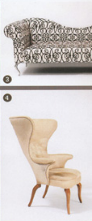
1. The Angles' furniture line, available at aquavivadesign.com , includes the Lacquer Vanity with mirror. 2. The Arc Dining Chairs are based on human vertebrae. 3. The S Chaise is inspired by the curvy line of a classic Cabriole table leg. 4. The Wingback Chair was designed to seamlessly fit the shape of the human body.